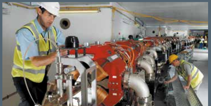
High Energy Physics