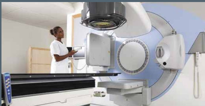
Industry and Medical Processes